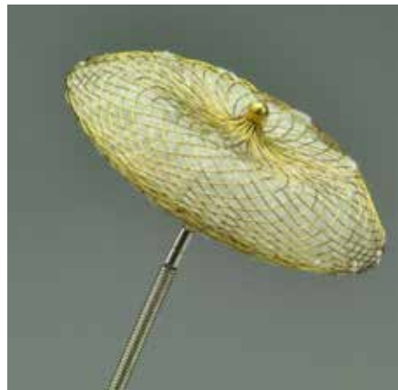
Figure 1. Cera septal occluder device.

connected by a short (4 mm) connecting waist ( Figure 1 ). The Cera delivery system comprises a delivery sheath, dilator, loader, haemostasis valve, and a delivery cable with plastic vice.